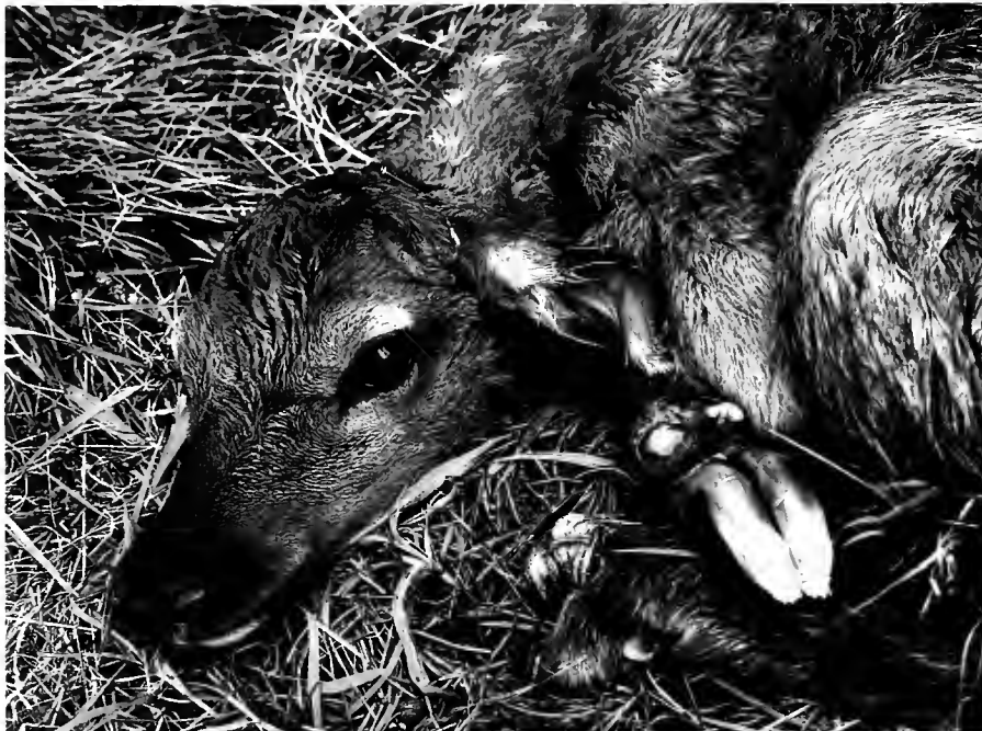
Newborn elk calf